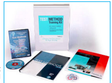
PSTC Testing Kit TLMI Testing Manual

Hand Roller: Used to laminate samples to test panels.