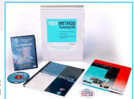
PSTC Testing Kit TLMI Testing Manual