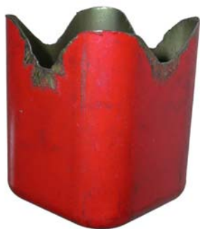
Square Deep Drawing Cup Test