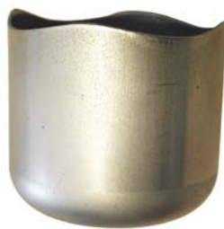
Deep Drawing Cup Test