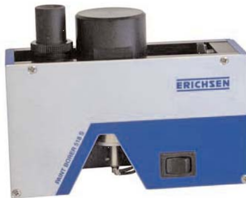
PAINT BORER 518 S