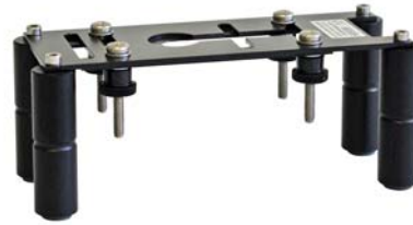
PAINT BORER with specimen platform